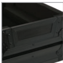
Removable case lid