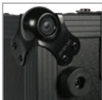
Industrial strength rubber feet at the bottom