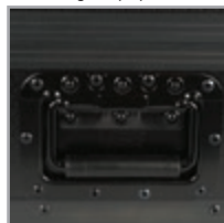
UDG spring-loaded handles