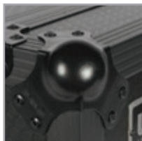
Heavy and powerful Steel Ball corners