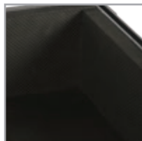
High density diamond embossed EVA foam protective padding