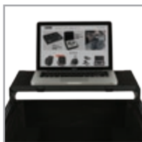
An extra notebook shelf included for your notebook

We, at UDG have further fine-tuned already a great design concept of our flight case into one specially for the most discerning DJ/producer. Constructed from solid 9mm thick plywood, the outside is laminated in a black finished honeycomb/hexagonal "Stage Grip" pattern. The inner sides are protected with high density diamond embossed EVA foam protective padding. This is extremely robust padding protects the equipment against scratches, dust or other damages, creating a unique stylish & practical finish.