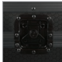
Recessed Butterfly Twist latch lock