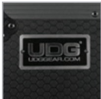
High grade aluminium UDG logo plate