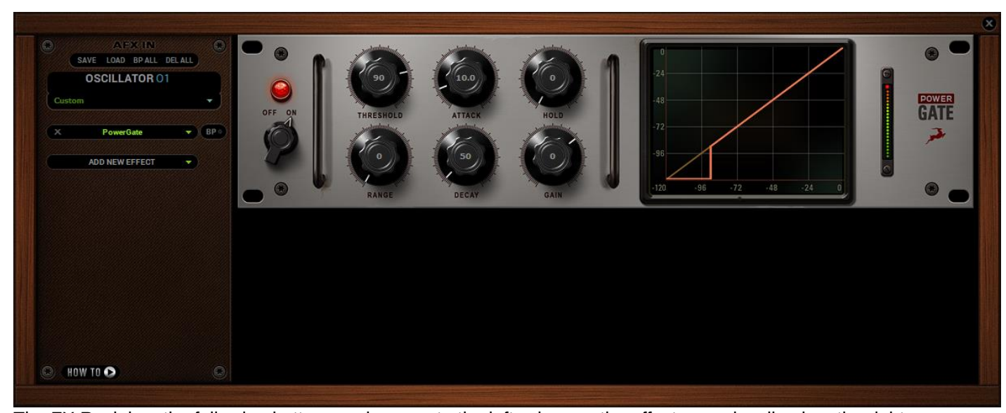
The FX Rack has the following buttons and menus to the left, whereas the effects are visualized on the right: