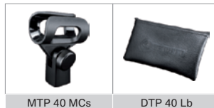
MTP 40 MCs